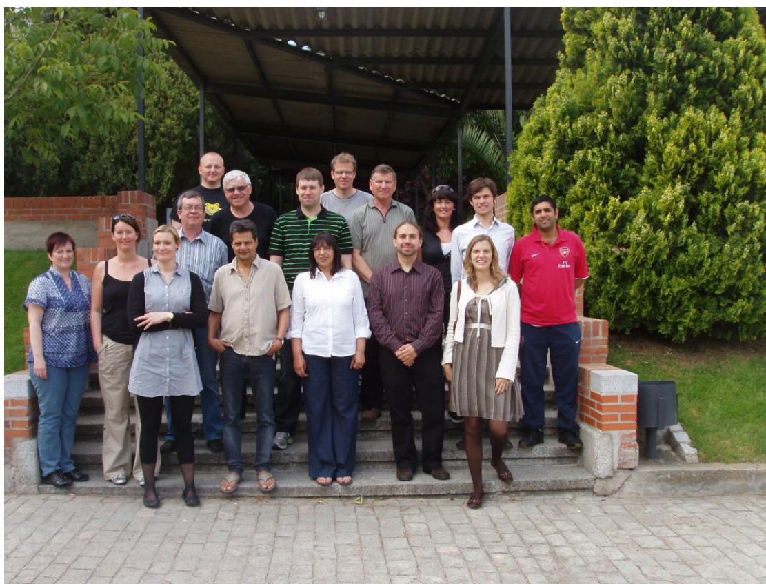
The KROSSS project team